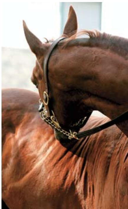
A horse that is colicky might look at or bite at his flanks or side.